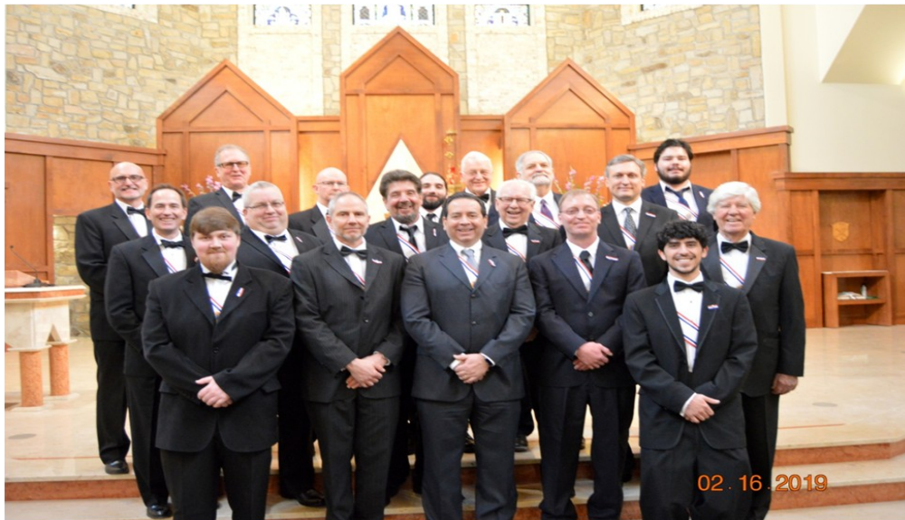
New Sir Knights From Assembly 3253